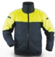
Use with X14SJ seafood

The brushed thermal lining is a lightweight yet warm solution and is combined with waterproof outer fabrics for the perfect seafood garment.